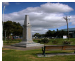
32350 Longwarry War mem