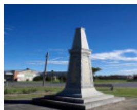
Longwarry War Memorial.jpg