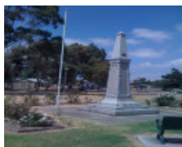
32350 longwarry war memorial