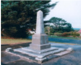
45014 WORLD WAR II MEMORIAL