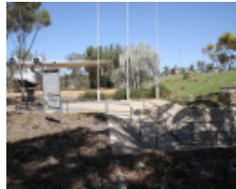
H2208 Boga Catalina and entry to Bunker Feb 09