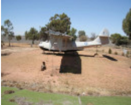
H2208 1-Lake Boga Catalina Feb 09 PM2