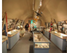
H2208 Boga Bunker interior Feb 09 PM2