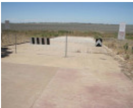
H2208 Boga Slipway Feb 09 PM2