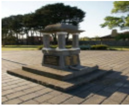
Pascoe Vale Memorial Drinking Fountain.jpg