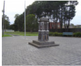
109 Cumberland Rd. WW2 memorial