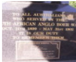
Swan Hill Memorial Boer War 05.jpg