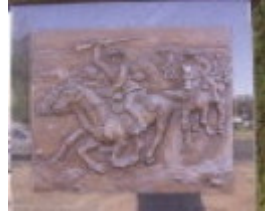
Swan Hill Memorial Boer War.jpg