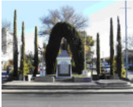
War Memorial Plantation, 2001