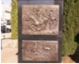
sSwan Hill Memorial Boer War_8 r.jpg