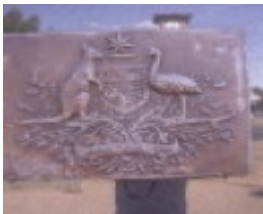
Swan Hill Memorial Boer War 02.jpg