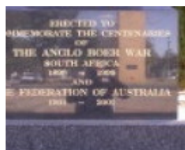
Swan Hill Memorial Boer War 3.jpg