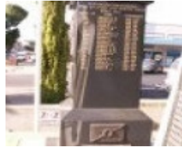
Swan Hill Memorial Boer War _010 r.jpg