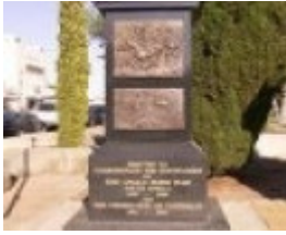
Swan Hill Memorial Boer War _010 r.jpg