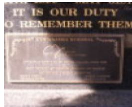
Swan Hill Memorial Boer War 04.jpg