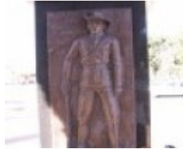
Swan Hill Memorial Boer War _010 r.jpg