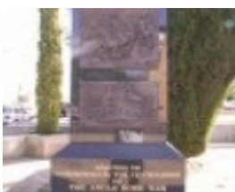
Swan Hill Memorial Boer War _010 r.jpg