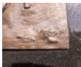
Swan Hill Memorial Boer War _0012.jpg