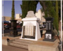
1. Swan Hill Memorial Plus Boer War Vietnam Veterans.jpg