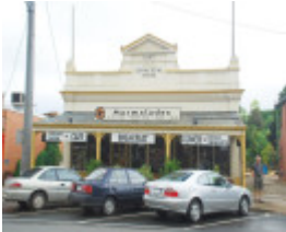
PURCELLS GENERAL STORE SOHE 2008