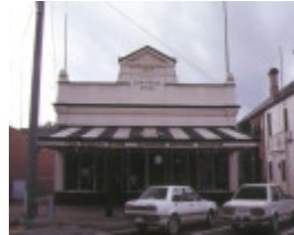
1 purcells general store high street yea front view apr1989