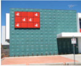
CRAIG & SEELEY OFFICES AND SHOWROOM SOHE 2008