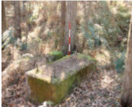
H02014 graves and frasers sawmill engine footing