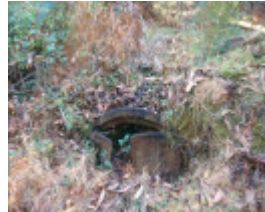
H02014 graves and frasers sawmill firebox