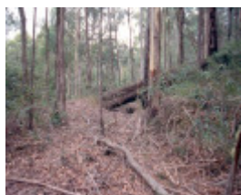
H02015 wheelers tramway