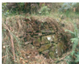
H02015 wheelers tramway retaining wall