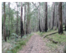
WHEELER'S TRAMWAY SOHE 2008