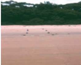
H02019 sealers cove saw mill site from beach