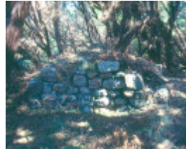
H02019 sealers cove saw mill stonework