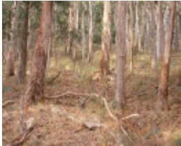
H02018 kozminskys mill and log chute chute