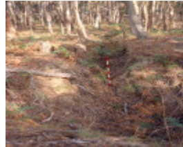
H02018 kozminskys mill and log chute mill site