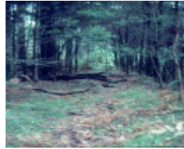
H02022 barbours log chute