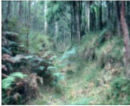
H02022 barbours tramway