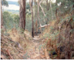
H02020 the glut escarpment log chute