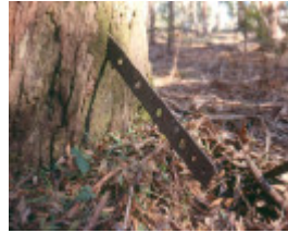
H02016 telegraph graves sawmill embedded iron