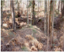
H02016 telegraph graves sawmill