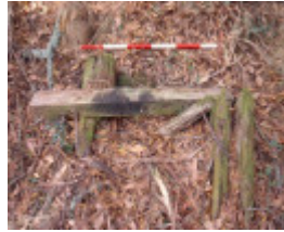
H02013 ordes ogden brothers sawmills mounting