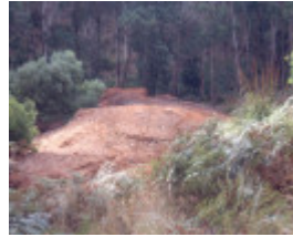
H02013 ordes ogden brothers sawmills sawdust mound