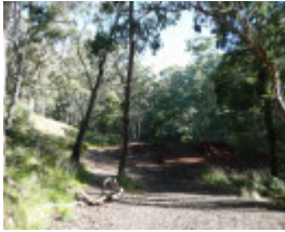
ORDE'S/OGDEN BROTHERS MILL SOHE 2008