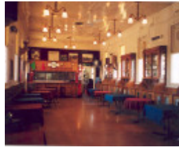
h02044 lilydale railway station refreshment room4