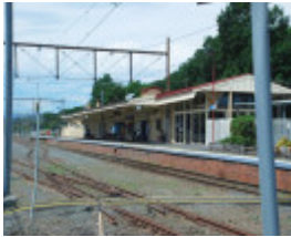
LILYDALE RAILWAY STATION REFRESHMENT ROOMS SOHE 2008