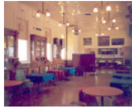
1_h02044 lilydale railway station refreshment room5