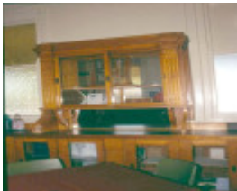
h02044 lilydale railway station refreshment rooms3