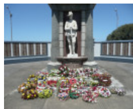
Warrnambool War Memorial 5.jpg