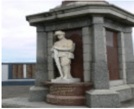
Warrnambool War Memorial 2.jpg