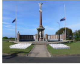
Warrnambool War Memorial 1.jpg