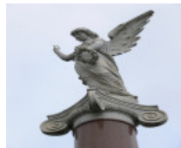
Warrnambool War Memorial 3.jpg