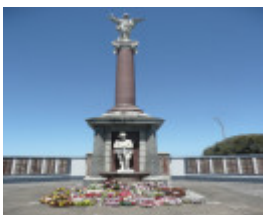
Warrnambool War Memorial 4.jpg