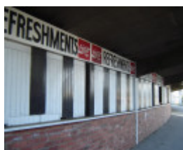
h00075 victoria park abbotsford june05 rush stand snackbar