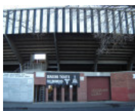
H0075 Victoria park abbotsford June05 Sherrin stand lulie street