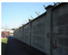
h00075 victoria park abbotsford june05 bath street concrete wall