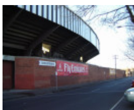
h00075 victoria park abbotsford june05 sherrin stand lulie street2