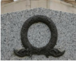
Caulfield War Memorial.jpg