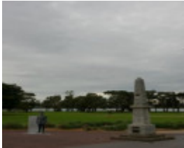
Hastings War Memorial.jpg