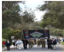
Tidal River Veteran Commando Parade.jpg