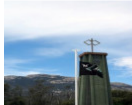
National Commando Memorial Tidal River, Wilsons Prom.jpg