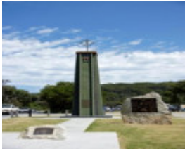
Tidal River Commando Memorial.jpg