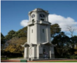
Ringwood Memorial Clock Tower.jpg