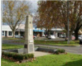
Maffra War Memorial 2.jpg