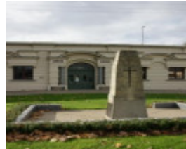
Maffra War Memorial 1.jpg