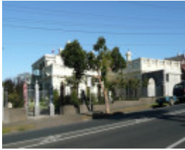
RANNOCH HOUSE SOHE 2008