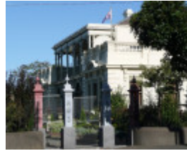
RANNOCH HOUSE SOHE 2008