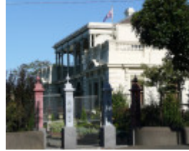
RANNOCH HOUSE SOHE 2008