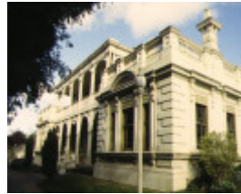
1 rannoch house pakington street newtown front view sep1995