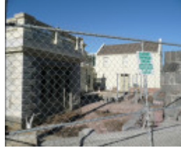
RANNOCH HOUSE SOHE 2008