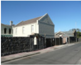
RANNOCH HOUSE SOHE 2008