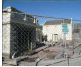
RANNOCH HOUSE SOHE 2008