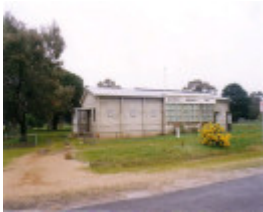
GL 01 - Shire of Northern Grampians - Stage 2 Heritage Study, 2004