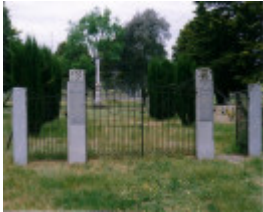
GW 37 - Shire of Northern Grampians - Stage 2 Heritage Study, 2004