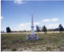
JJ 01 - Shire of Northern Grampians - Stage 2 Heritage Study, 2004