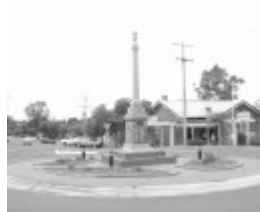
108531 IMG 1479