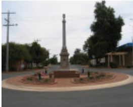
108531 IMG 1437