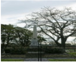
Glen Waverley WWI Memorial.jpg