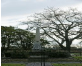
Glen Waverley WWI Memorial.jpg