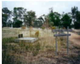
SM 15 - Cemetery, Stuart Mill Low Road, STUART MILL