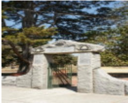
Mentone Memorial Gates.jpg