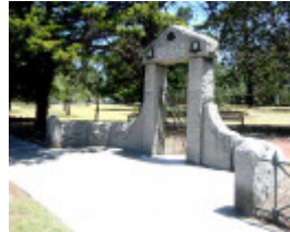
City of Kingston Heritage Study