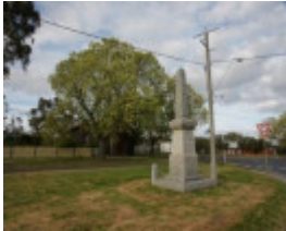
Bulla War Memorial.jpg