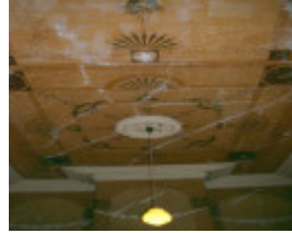
h01697 rothbury drawing