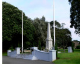
Koroit War Memorial 1.jpg