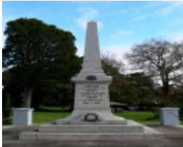
Koroit War Memorial 2.jpg