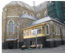
St Mary Star of teh Sea_West Melb_rear with sacristy_KJ_27/6/08