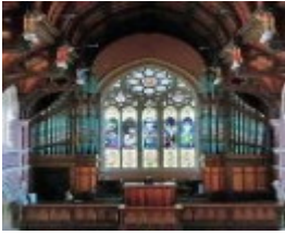
St Mary Star of the Sea_West Melb_organ_KJ_27/6/08