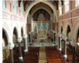
St Mary Star of the Sea_West Melbourne_nave_KJ_27/6/08