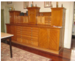
St Mary Star of teh Sea_West melb_vesting bench in sacristy_Kj_27/6/08