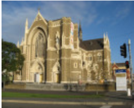
St Mary Star of the Sea_church ext_KJ_27/6/08