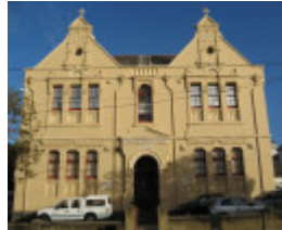
St MAry Star of the Sea_West Melbourne_boys school_KJ_27/6/08