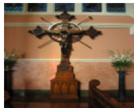
St Mary Star of the Sea_West Melb_crucifix_KJ_27/6/08