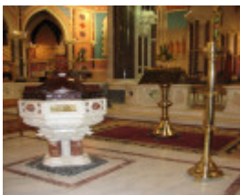
St Mary Star of the Sea_West Melb_font in transept_KJ_27/6/08