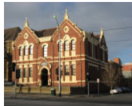
St MAry Star of the Sea_West Melb_girls school_KJ_27/6/08