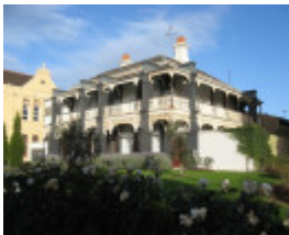
St Mary Star of the Sea_West Melb_presbytery_KJ_27/6/08