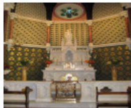
St Mary Star of the Sea_West Melb_chapel_KJ_27/6/08