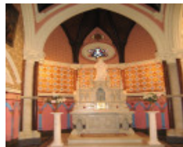
St Mary Star of the Sea_West Melb_chapel_KJ_27/6/08