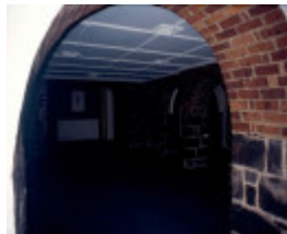
h02037 shrublands canterbury cellar interior