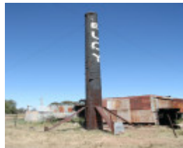
Chimney Eucalyptus Factory Inglewood Oct 2006