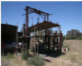
Gantry and still lid Eucalyptus Factory Inglewood Oct 2006