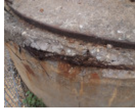
H0276 EUCALYPTUS DISTILLERY LHA 2015 7.JPG