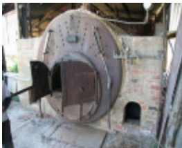
Boiler Eucalyptus Factory Inglewood Oct 2006