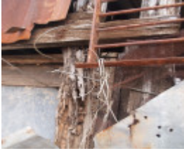
H0276 EUCALYPTUS DISTILLERY LHA 2015 6.JPG