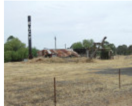
EUCALYPTUS DISTILLERY SOHE 2008