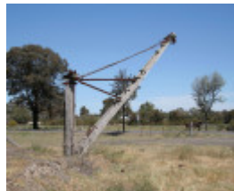
Crane Eucalyptus Factory Inglewood Oct 2006