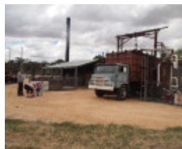
H0276 EUCALYPTUS DISTILLERY LHA 2015 2.JPG