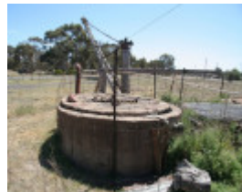
Brick vat Eucalyptus Factory Inglewood Oct 2006