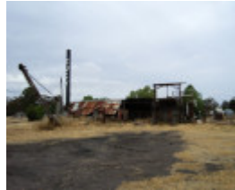
EUCALYPTUS DISTILLERY SOHE 2008