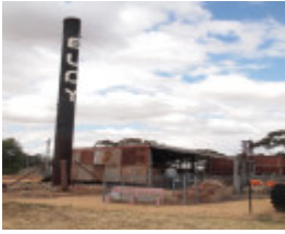
H0276 EUCALYPTUS DISTILLERY LHA 2015 3.JPG