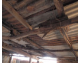
H0276 EUCALYPTUS DISTILLERY LHA 2015 8.JPG