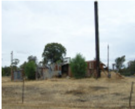
EUCALYPTUS DISTILLERY SOHE 2008