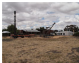
H0276 EUCALYPTUS DISTILLERY LHA 2015 1.JPG