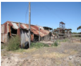
Sheds and still gantry Eucalyptus Factory Inglewood Oct 2006