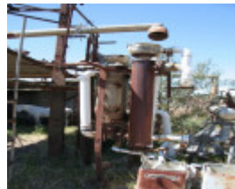
Condensers Eucalyptus Factory Inglewood Oct 2006