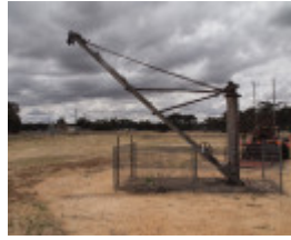
H0276 EUCALYPTUS DISTILLERY LHA 2015 5.JPG