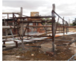
H0276 EUCALYPTUS DISTILLERY LHA 2015 4.JPG