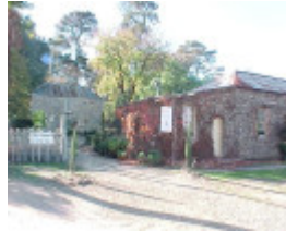
h02038 black springs bakery beechworth bakery barn