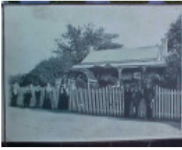
h02038 black springs bakery beechworth house