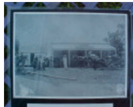
h02038 black springs bakery beechworth bakery 4