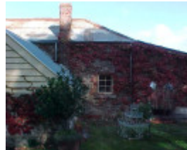
h02038 black springs bakery beechworth bakery 2