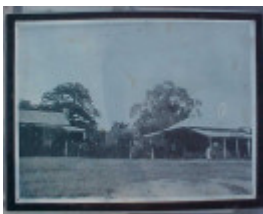
h02038 black springs bakery beechworth bakery and house