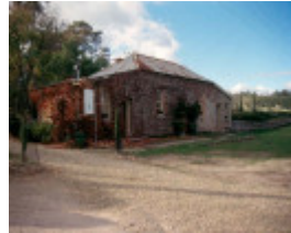
h02038 1 black springs bakery mz aug03