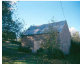
h02038 black springs bakery mz aug03 stables