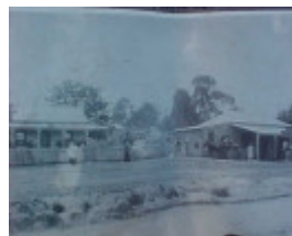
h02038 black springs bakery beechworth bakery house barn