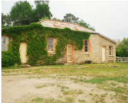
BLACK SPRINGS BAKERY SOHE 2008