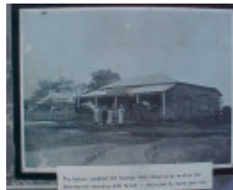
h02038 black springs bakery beechworth bakery 5