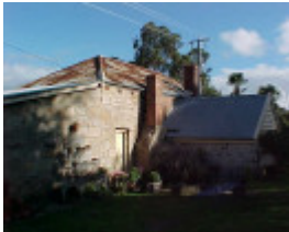
h02038 black springs bakery beechworth bakery 1