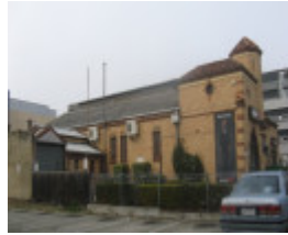
Avon Butter Factory