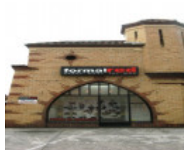
Avon Butter Factory