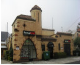
Avon Butter Factory