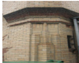
Avon Butter Factory