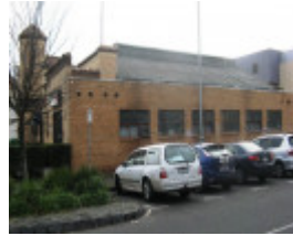
Avon Butter Factory