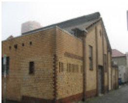
Avon Butter Factory