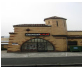
Avon Butter Factory