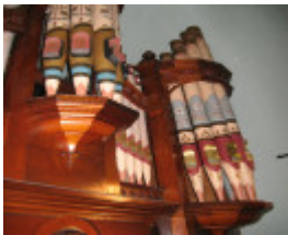
Fincham & Hobday organ_South melbourne_KJ_sept 08