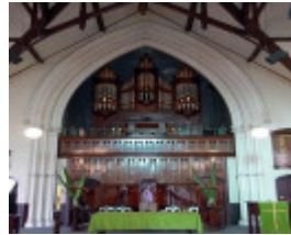
Fincham & Hobday organ_South Melbourne Southport Uniting_KJ_Sept 08