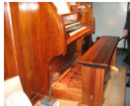
Fincham & Hobday organ_South Melbourne Southport Uniting_KJ_Sept 08