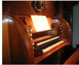
Fincham & Hobday organ_South Melbourne Southport Uniting_KJ_Sept 08