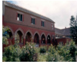
h02057 st aidans orphanage bendigo link