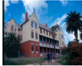
h02057 1 st aidans orphanage bendigo