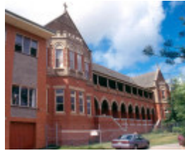
h02057 st aidans orphanage bendigo 1931