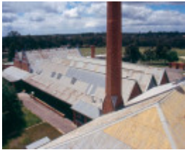
h02057 st aidans orphanage bendigo laundry