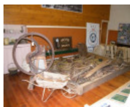
relocation of the sectional steam cyl. from the All Nations gold mine to the Woods Point museum.