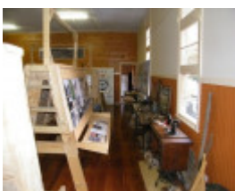
relocation of the sectional steam cyl. from the All Nations gold mine to the Woods Point museum.