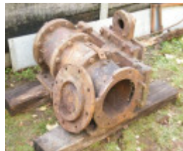
relocation of the sectional steam cyl. from the All Nations gold mine to the Woods Point museum.