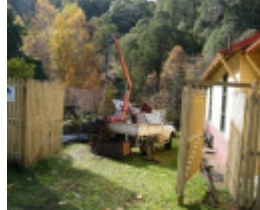
Relocation of the sectional steam cyl. from the All Nations gold mine to the Woods Point museum.