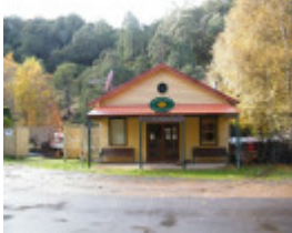
Relocation of the sectional steam cyl. from the All Nations gold mine to the Woods Point museum.