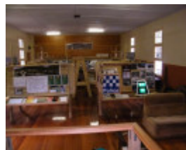
relocation of the sectional steam cyl. from the All Nations gold mine to the Woods Point museum.