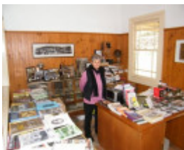
relocation of the sectional steam cyl. from the All Nations gold mine to the Woods Point museum.