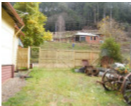
Relocation of the sectional steam cyl. from the All Nations gold mine to the Woods Point museum.