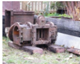
Relocation of the sectional steam cyl. from the All Nations gold mine to the Woods Point museum.