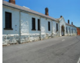
Relocation of the sectional steam cyl. from the All Nations gold mine to the Woods Point museum.