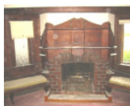
h01033 east view heidelberg living room 03 nov2004 mz