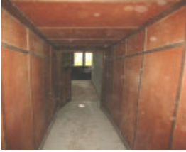
h01033 east view heidleberg tunnel nov2004 mz