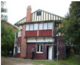
h01033 east view heidelberg rear elevation nov2004 mz