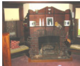
h01033 east view heidelberg living room 01 nov2004 mz