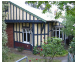
h01033 east view heidelberg front elevation 03 nov2004 mz