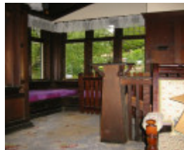
h01033 east view heidleberg entry window seats 02 nov2004 mz