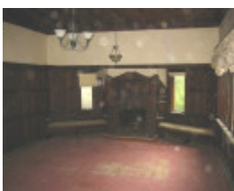
h01033 east view heidelberg living room 02 nov2004 mz