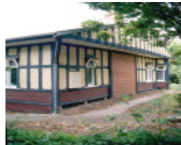
h01033 east view heidelberg front elevation 02 nov2004 mz