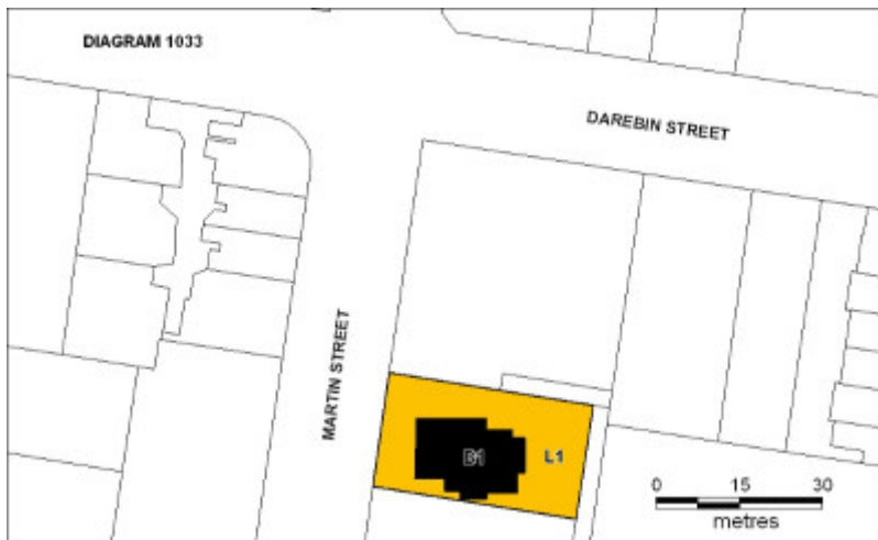
h01033 east view plan dec2004 mz