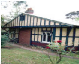
h01033 1 east view heidelberg front elevation 01 nov2004 mz