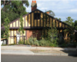
EAST VIEW SOHE 2008