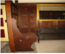
h01033 east view heidleberg screen seat nov2004 mz