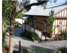
EAST VIEW SOHE 2008