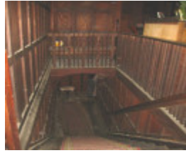
h01033 east view heidleberg stairs 02 nov2004 mz