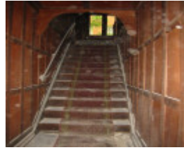
h01033 east view heidleberg stairs 01 nov2004 mz