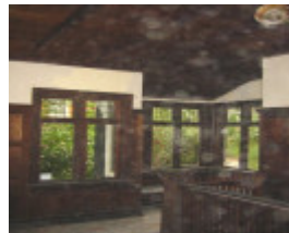
h01033 east view heidleberg entry window seats 01 nov2004 mz