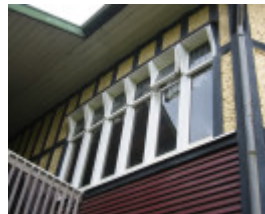
h01033 east view heidelberg windows nov2004 mz