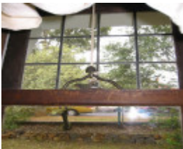
h01033 east view heidleberg window detail nov2004 mz