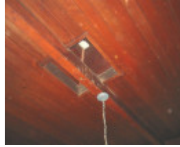
h01033 east view heidleberg ceiling vent nov2004 mz