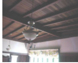
h01033 east view heidleberg cieling 01 nov2004 mz