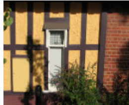
EAST VIEW SOHE 2008