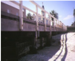
pier off kerford road albert park side detail