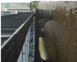
SANDRIDGE RAILWAY LINE BRIDGE October 2016