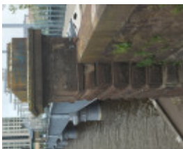
SANDRIDGE RAILWAY LINE BRIDGE October 2016