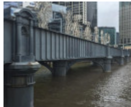
SANDRIDGE RAILWAY LINE BRIDGE October 2016