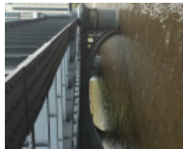
SANDRIDGE RAILWAY LINE BRIDGE October 2016