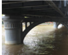
SANDRIDGE RAILWAY LINE BRIDGE October 2016