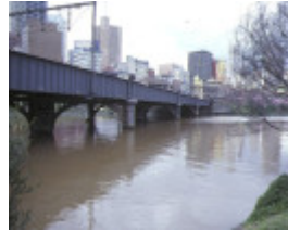
1 sandridge railway line bridge over yarra river melbourne view over river aug1985