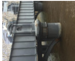
SANDRIDGE RAILWAY LINE BRIDGE October 2016