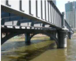
SANDRIDGE RAILWAY LINE BRIDGE SOHE 2008