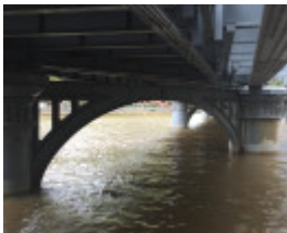
SANDRIDGE RAILWAY LINE BRIDGE October 2016