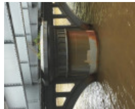
SANDRIDGE RAILWAY LINE BRIDGE October 2016