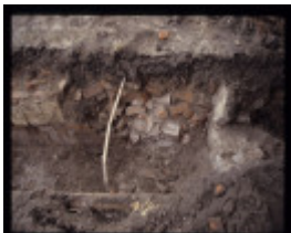
JOLIMONT SQUARE EXCAVATION