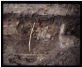
JOLIMONT SQUARE EXCAVATION