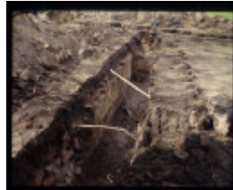
JOLIMONT SQUARE EXCAVATION