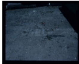
JOLIMONT SQUARE EXCAVATION