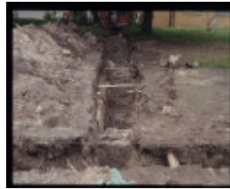
JOLIMONT SQUARE EXCAVATION