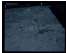
JOLIMONT SQUARE EXCAVATION