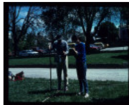
JOLIMONT SQUARE EXCAVATION