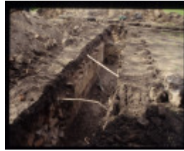
JOLIMONT SQUARE EXCAVATION