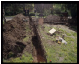
JOLIMONT SQUARE EXCAVATION