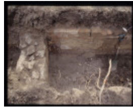
JOLIMONT SQUARE EXCAVATION