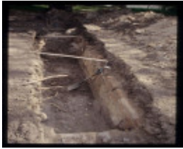
JOLIMONT SQUARE EXCAVATION