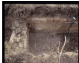
JOLIMONT SQUARE EXCAVATION