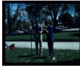
JOLIMONT SQUARE EXCAVATION