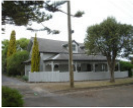
FORMER PORTLAND INN SOHE 2008