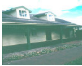
h02071 h2071 former portland inn july 2004