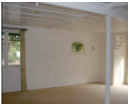
h02071 h2071 former portland inn ground floor july 2004