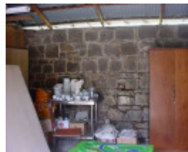
h02071 portland inn bluestone wall