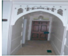
h02071 h2071 former portland inn passageway july 2004