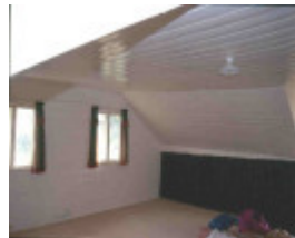
h02071 h2071 former portland inn billiard room july 2004