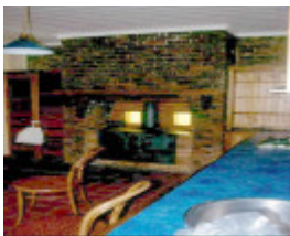
h02071 h2071 former portland inn rear wing kitchen july 2004