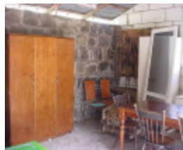
h02071 portland inn bluestone wall 2