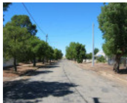
h02061 kurrajong trees comyn street 01 2004