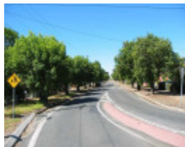
h02061 1 kurrajong trees comyn street 02 2004