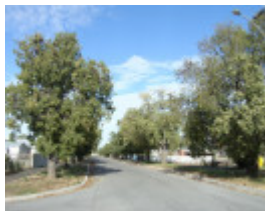
KURRAJONG AVENUE SOHE 2008