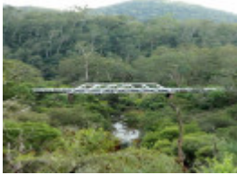
Murrindal River Bridge picturesque.jpg