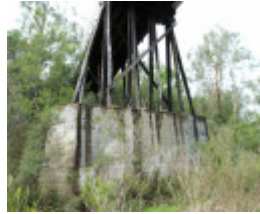
Murrindal trestle on cutwater IMG_0939.jpg