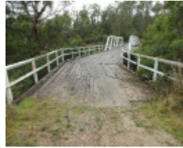
Murrindal curved approach 2.jpg