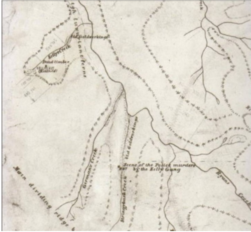
H2205 1884 Surveyors Plan