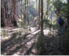
Stringybark Creek site